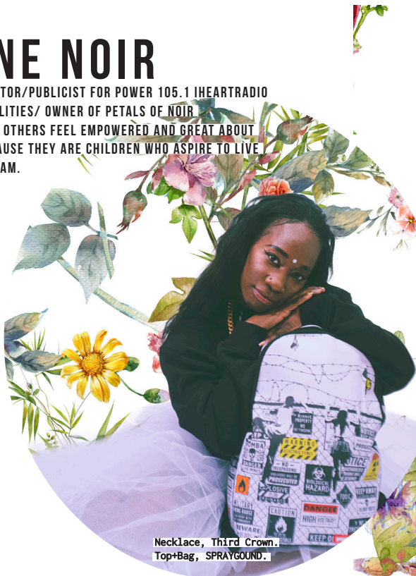
Necklace, Third Crown. Top+Bag, SPRAYGROUND.

Being empowered to me means that I can accomplish anything I set my mind to. If I have an idea or want to meet someone, or create something, the only thing in my way is me not doing it.