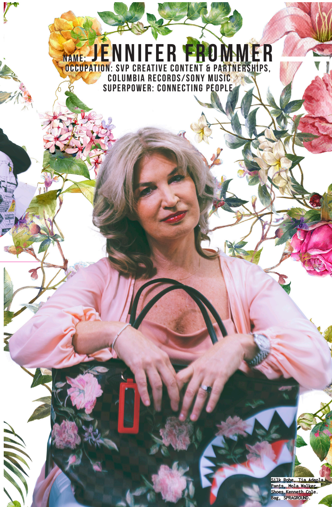
Silk Robe, Tia Adeola Pants, Mola Walker Shoes, Kenneth Cole. Bag, SPRAGROUND.

OCCUPATION: SVP CREATIVE CONTENT & PARTNERSHIPS, COLUMBIA RECORDS/SONY MUSIC SUPERPOWER: CONNECTING PEOPLE