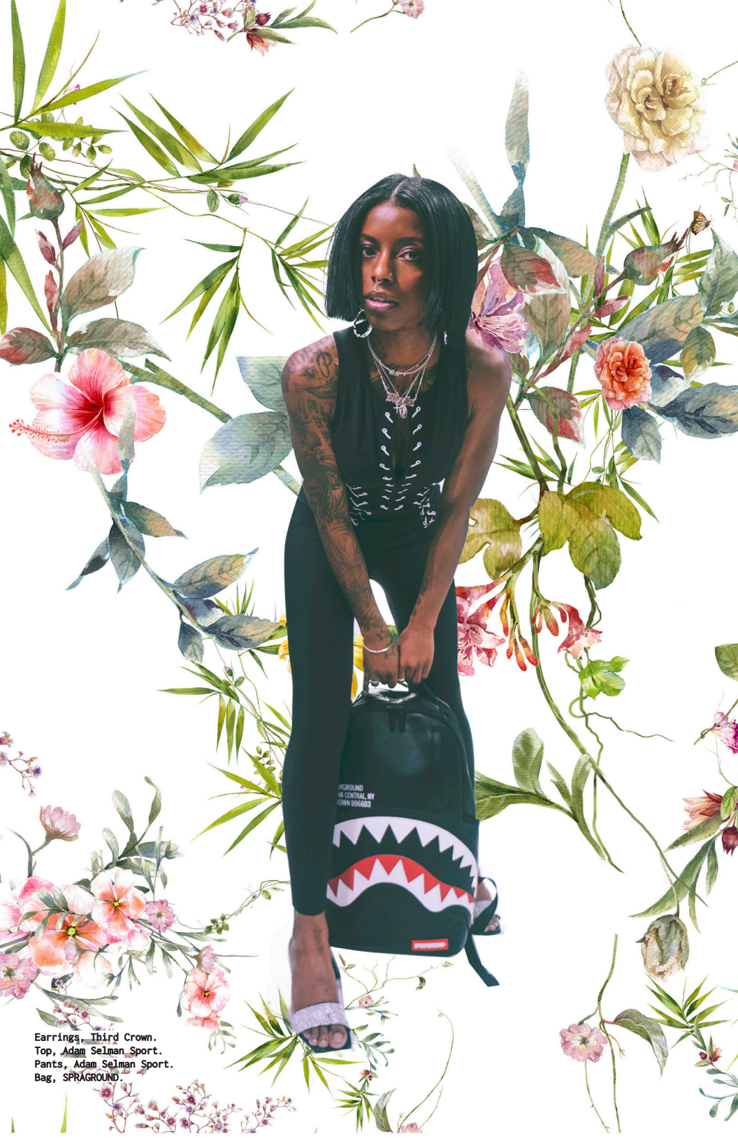
Earrings, Third Crown. Top, Adam Selman Sport. Pants, Adam Selman Sport. Bag, SPRAGROUND.