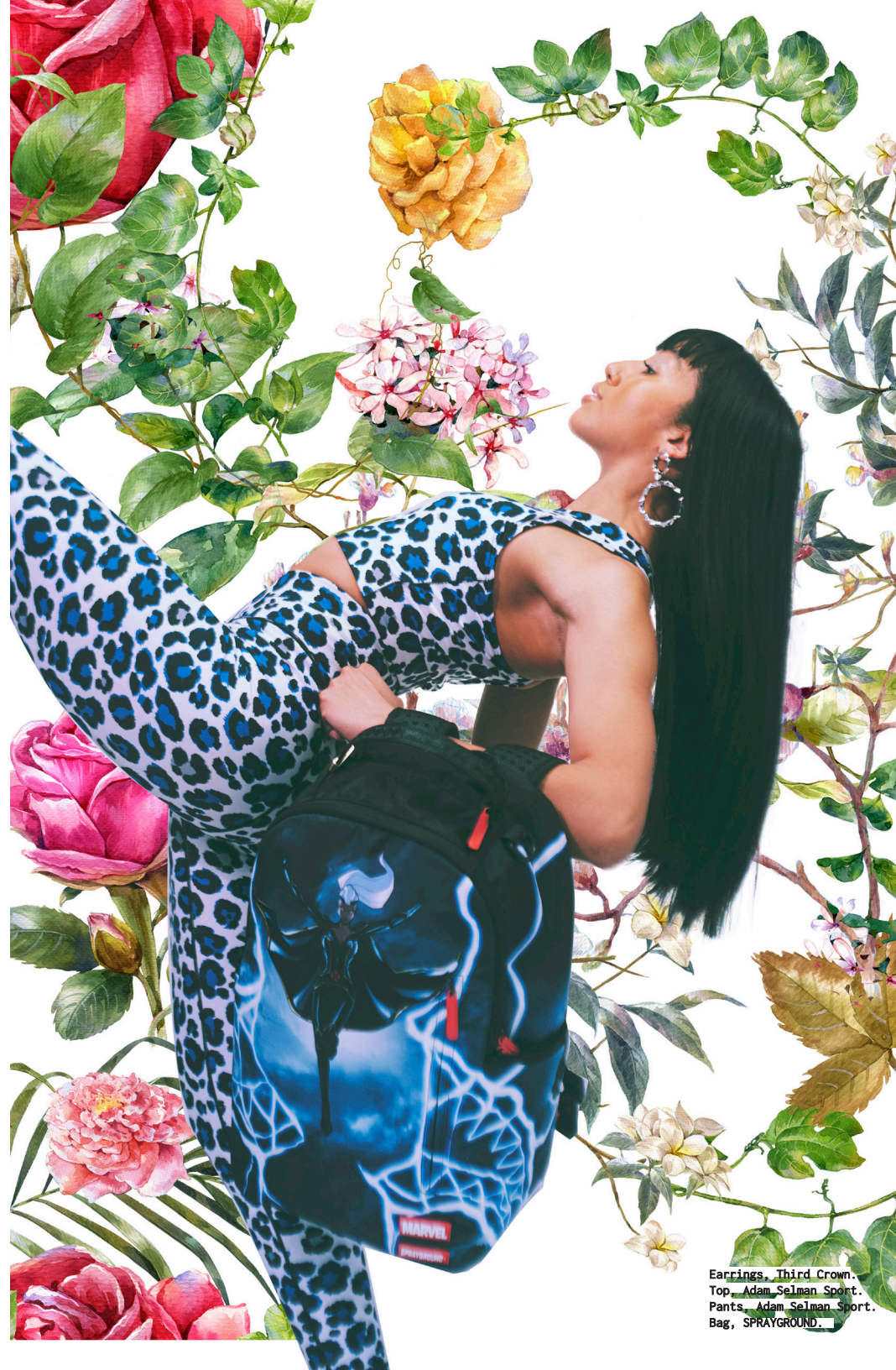
Earrings, Third Crown. Top, Adam Selman Sport. Pants, Adam Selman Sport. Bag, SPRAYGROUND.